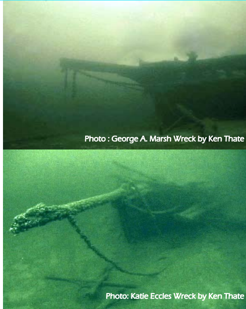
George A. Marsh Wreck

Suddenly the ship was in a fast rising and raging, violent storm. The crew of the George A. Marsh fought the storm for hours and continue through the night. With the battle lasting well into the night, the hull of the overloaded ship could not take anymore, with the Port of Kingston in site, she split open at the seams, and lake Ontario, filled her passage ways.