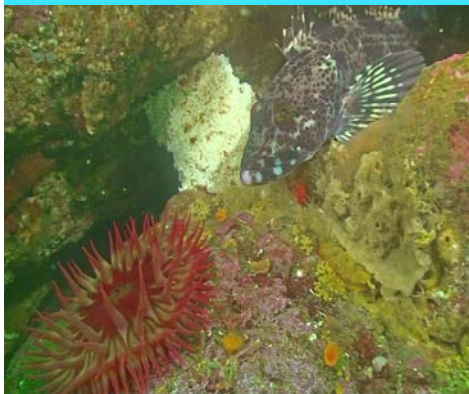
Photo: Male Ling Cod, guarding egg mass, Pacific Northwest

Almost every diver has had an encounter with the omnipresent lingcod ( Ophiodon elongatus ). Few however realize that this is not a true cod but a family member of the greenlings or Hexagrammidae family.