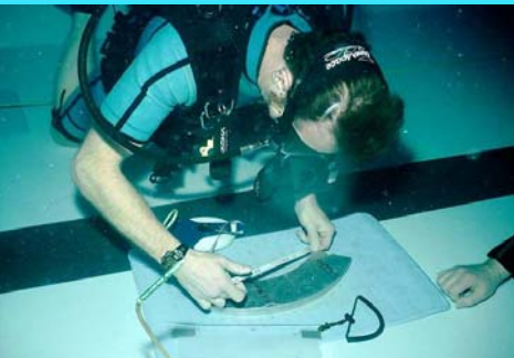
Photo shows diver participating in NAS Course in pool

Over the past couple of years, a number of divers from Alberta have come to B.C. to participate in our projects and courses. It was suggested that one of us write an article explaining a little bit more about what it is that we do over here on the west side of the mountains. UASBC was started more than thirty years ago when a group of UBC university students who had been taking an archaeology course decided that they would like to continue exploring our underwater heritage. Over the years, UASBC became a group of like minded members made up of advocates, a few professionals, and people with a general interest in the topic. Our mission statement is perhaps the best way to sum up the society: "The Underwater Archaeological Society