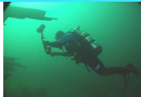
Diver "in the field" documenting wreck with camera

A video of this behaviour can be watched on U-TUBE! See link on Rendezvousdiving.com